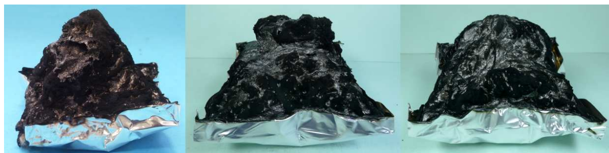
Figure 2. Intumescent fire residues of PET-P-DOPO, PET-P-DPPO, and PET-P-DPhPO (from left to right) obtained with an irradiation of 50 kW/m 2 in the cone calorimeter.

flame-retardancy mechanisms including flame inhibition, charring, and a protection effect of intumescent char are simultaneously active in all three phosphorus polyesters leading to decreased fire risk. Flame inhibition was similarly strong in the three phosphorus polyesters despite their different structure. The amount of residue formed clearly depended on the structure of the polyester. PET-P-DPhPO (phosphine oxide structure, non-bridged phenyl rings) yielded less residue (27 wt.%) than PET-P-DOPO and PET-P-DPPO. The first step in the formation of char is cross-linking. 5 Therefore, PET-P-DPPO with its bridged phenyl rings formed more residue (33 wt.%) than PET-P-DPhPO. PET-P-DOPO formed a high residue (40 wt.%) because of its bridged phenyl rings and because of using phosphinate instead of phosphine oxide. 6